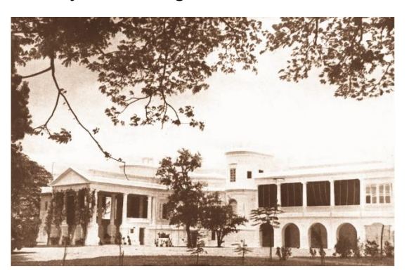
Ans. The Broadies Castle, Adyar and it serves as the Music college