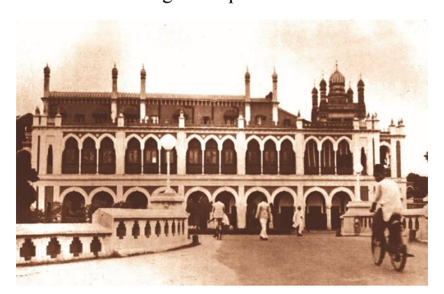
Ans. Chepauk Palace