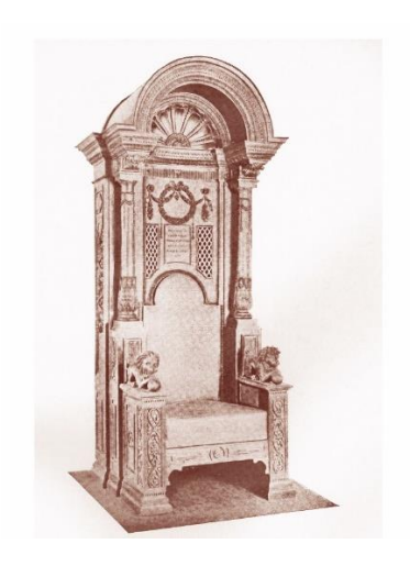
Ans. Seat of Madras Mayor. Presented by the Kumararaja of Chettinad to the Corporation of Madras when he was Mayor in 1933.