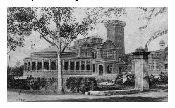
Ans. Government Museum and Library Egmore.